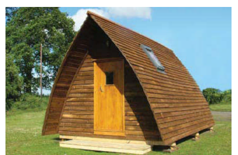
Fig. 2: Typical wigwam