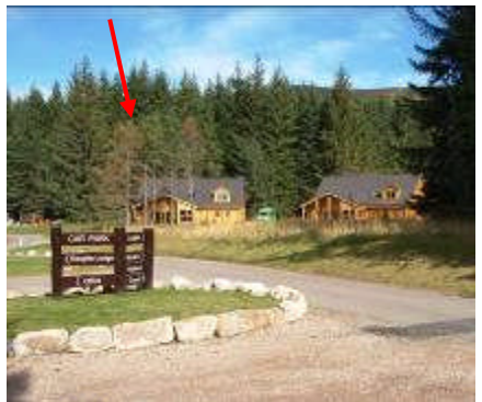
Fig. 7: Proposed site to the rear of existing lodges

7. The new wigwams and camping area would be serviced by existing facilities at the Badaguish Outdoor Centre. A range of new facilities have been developed in recent years including a new shower and toilet block, a new café / common room / clubhouse, and 2 new self catering kitchens. Reference is also made in supporting documentation to the intention to renovate the existing small laundry and toilet block which is located immediately to the south of the proposed camping area.