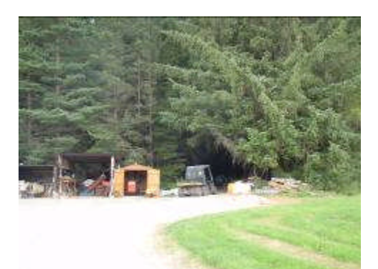
Fig. 6: southern site boundary, showing track leading into proposed site

Pathways would be developed<sup>2</sup> through the site, to provide access to the 6. canvas tent and wigwam areas. The principle path route follows an existing track through the woodland. All paths would be wheelchair accessible. The landscape strategy which is proposed in connection with the new development involves the retention of significant areas of the existing woodland around the perimeter of the identified site area, as well as the retention of larger woodland blocks in the south eastern area and also in some areas to the west of the phase one wigwam development. As the areas in which the wigwams and the mountain bike free rides skills area is proposed would necessitate clear felling, a tree planting plan has been submitted to demonstrate re-planting proposals. The new tree planting is proposed to consist of a mixture of seminatural deciduous woodland, which is intended to provide an increased canopy area. Birch, rowan and juniper have been detailed as the main species to be planted in open areas and around the edges of the site. Alder, aspen and willow are proposed in the area adjacent to the burn which runs adjacent to the western site boundary.