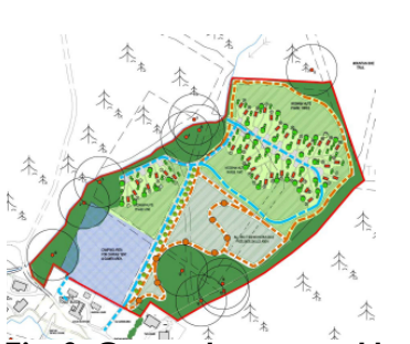
Fig. 8: Original pre-application proposal