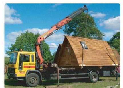
Fig.3: Craning into place